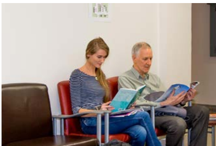
13. Endoscopy waiting room.