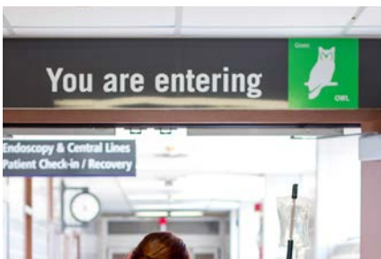
10. Hallway to Patient Check-in, go down hall and Patient Check-in is on the left.