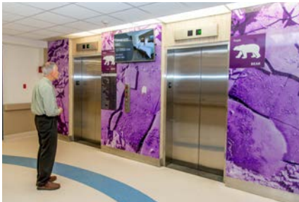
7. Taking the Polar Bear elevator to the 7th Floor.