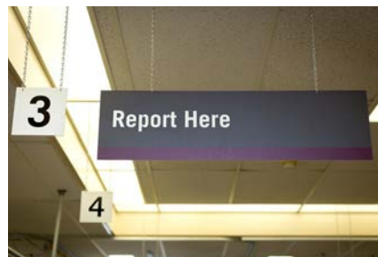
11. Patient Check-in sign.