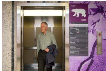
8. Exit elevator on 7th floor.