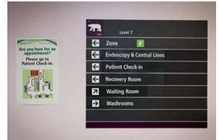
9. Turn left at this sign.