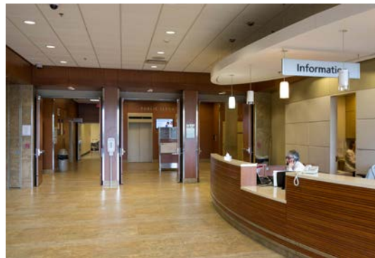
4. The Information Desk where you can ask for directions including from Volunteer Ambassadors in red vests.

For more information on colonoscopy visit: mycolonoscopy.ca .