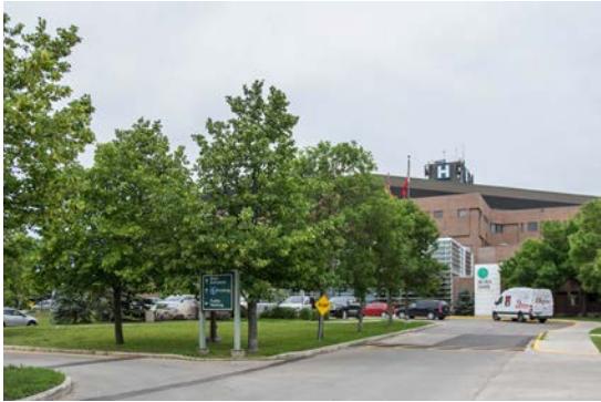
1. Approach to Main entrance of SOGH showing parking at left.