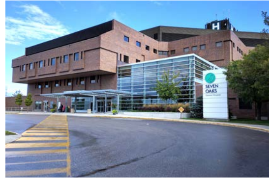
2. The Main entrance to SOGH.